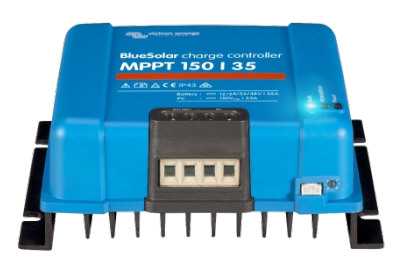
Solar Charge Controller MPPT 150/35