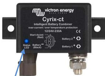
LED status indicator