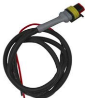
Control cable for Cyrix-ct 12/24-230 Length: 1 m