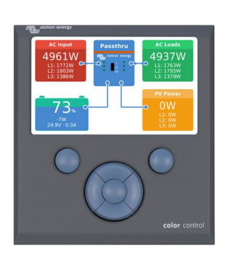
Color Control GX, showing a PV application

When connected to the Ethernet, systems with a Color Control GX or other GX device can be accessed and settings can be changed remotely.