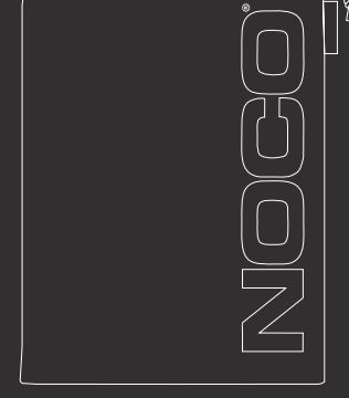
Microfiber Storage Bag